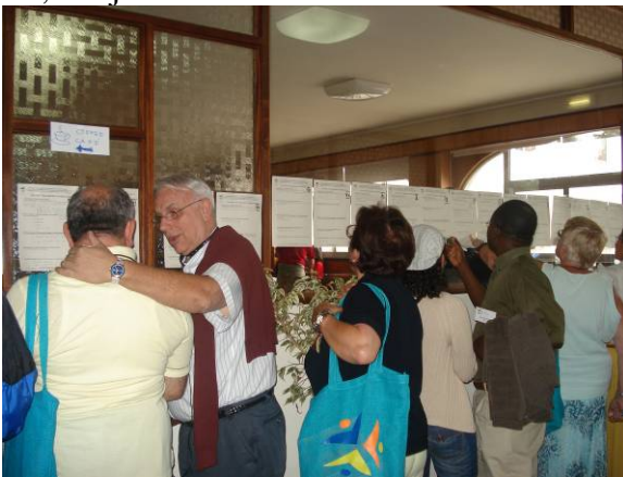
Portuguese coffee and Projects