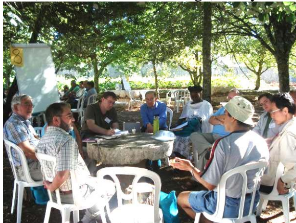
One of the circles in Open Space

We sat together in a circle, laics and priests, old and young together. We shared our experiences. We offered our hearts to one another. We searched for possible solutions. We embraced others’ ideas. We agreed together at the end. Some started the session with a prayer, some did not. I wish that we all did. It was so beautiful to witness the desires in keeping building CLC into a more effective apostolic body unfolding into concrete actions, transcending all boundaries. “Is this what the Church really is?” I wondered to myself. Again, I was confirmed in the fast pace of the day that CLC is that “precious stone”, of the presence of God within and without us, of the guidance of the Holy Spirit for CLC. All the desolations of the previous days seemed to be overwhelmed by the sincerity of all. We recognized the ambivalences and unknowns on the road ahead that we are traveling, but we are assured that it is nevertheless the road that God has called us to take. Father Mecieca’s message to the assembly the previous day was just perfectly timed: Do not fear to move forward.