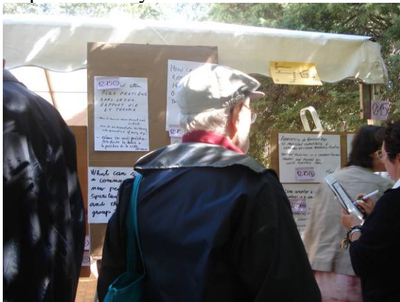
The “market” of Open Space

Morning prayers brought us into the contemplation of Pentecost. It was a sudden and immediate sign that the presence of God could not be mistaken. All were embraced by the grace of God, no exceptions. We were invited to read similar signs for our national communities. (Dear friends, can you see the signs with sudden and immediate impacts in your communities?) Like the apostles 2,000 years ago, they received unique gifts from the Holy Spirits and began their journey. The assembly was invited to collect the gifts that the Holy Spirit has bestowed on our communities, and especially on each of the delegates. We were invited to use the gifts so together to build up CLC into a more effective apostolic body of and for the Church.